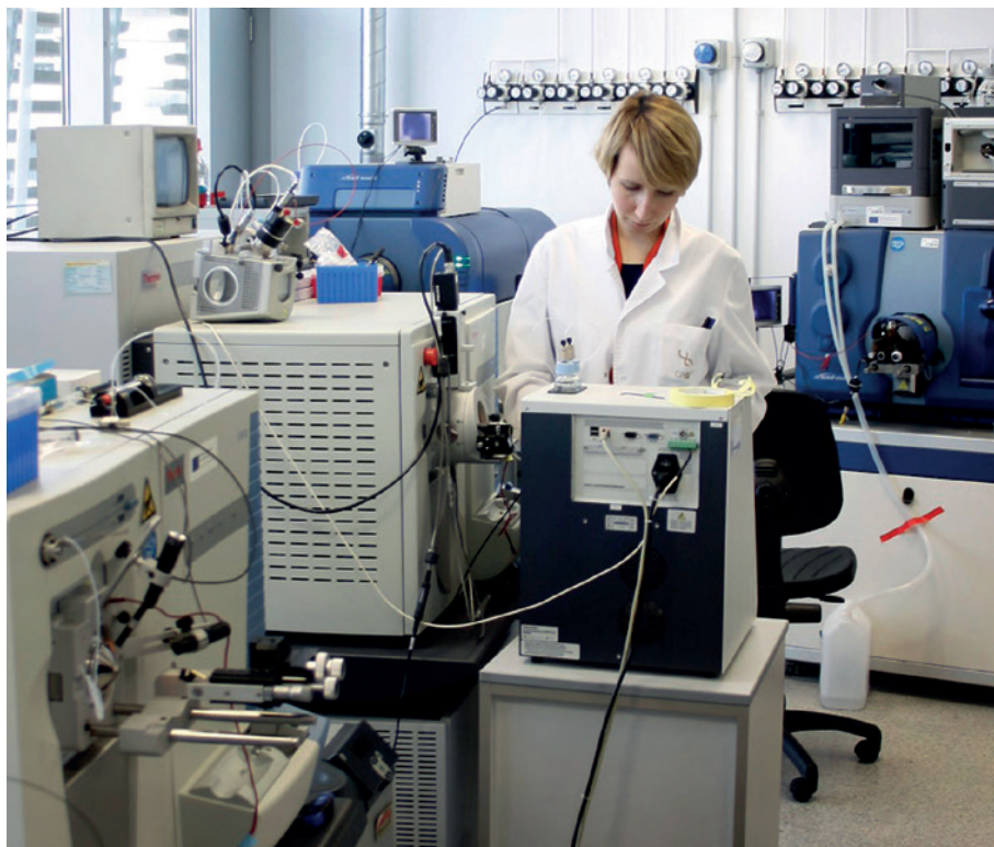
One of the core facilities at Spain's Centre for Genomic Regulation provides proteomics services.

NATUREJOBS For the latest career listings and advice www.naturejobs.com