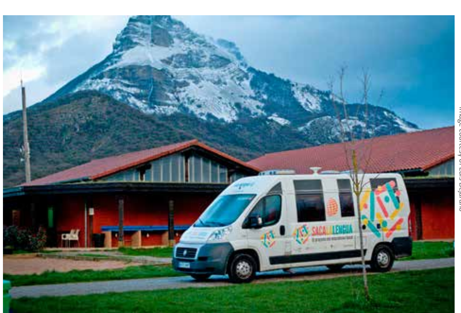
On the road